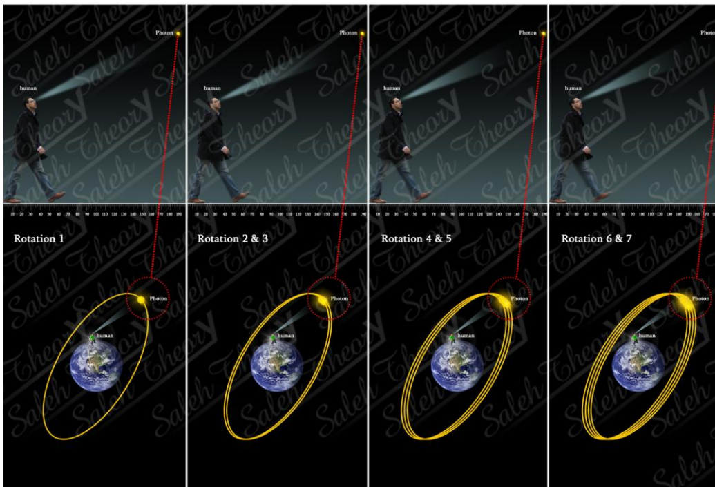
When a human takes a step, photon makes about 7.5 turns around the Earth

Imagine yourself observing a photon that is back and forth on a line that measures thousands of meter; He crosses this long road in a hundredth of a second, but you, at each glance, you will find him motionless because of his extravagant speed. In fact, you cannot follow the photon's motion and you only see some images representing each phase of movement without being able to distinguish one from the other. You find the photon permanently still as he finds you.